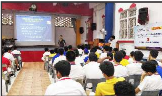
Awareness programs for students at Campion English Medium School.