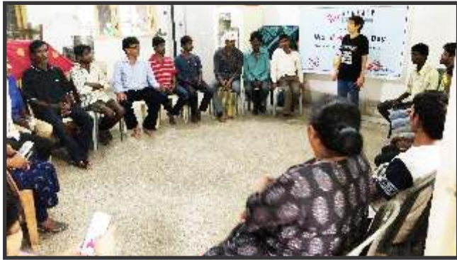
Observing World Hepatitis Day - 28 July 2018