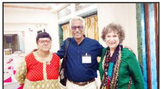
Alcohol & ART Adherence among HIV + Men in India - 14th Feb 2019