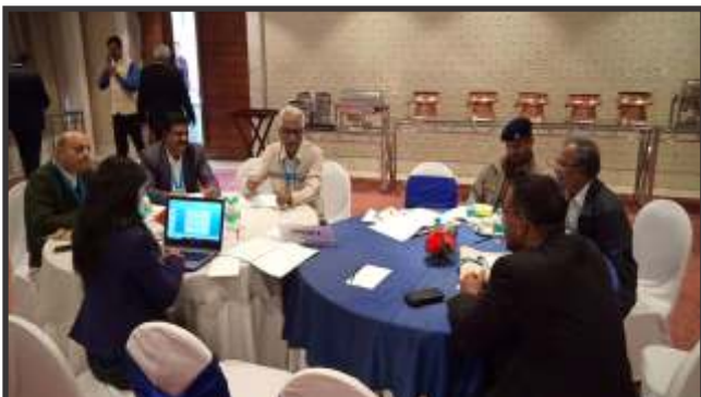
2 day National Consultation with Police Training Academies in the context of Drug Use and HIV held in Delhi – 11th Jan 2018