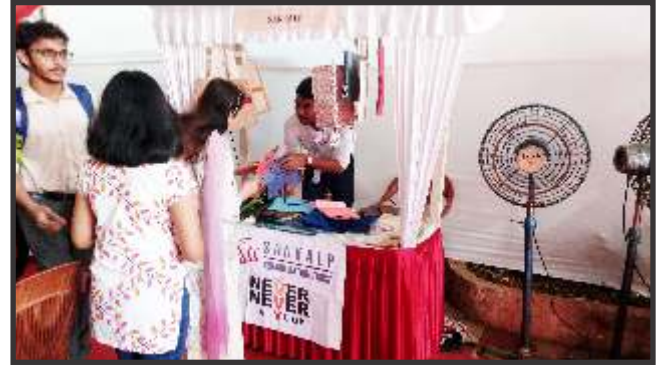
Exhibition cum Charity Sale at Govt. Law College, Mumbai – 20th-22th March 2018