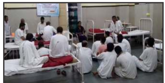
Awareness Program for Staff & Patients at G.T Hospital, Rehabilitation Ward