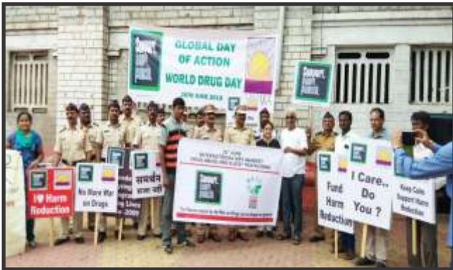
Sankalp Rehabilitation Trust at the Western Harm Reduction Network, Sahara Pune Rally

In a resolution passed in December 1987, the UN General Assembly proclaimed 26th June as the "International Day Against Drug Abuse and Illicit Trafficking". In pursuance of this declaration, this day is observed all over the world to raise public awareness against the menace of drugs. During the month-long function, various events are organized worldwide to sensitize various sections of society to the consequences of drug abuse, prevention methods, as well as treatment services available.