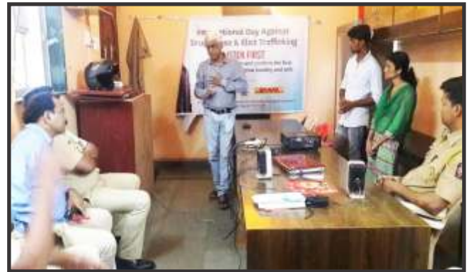
Sensitization Program at Tardeo Police Station on issues relating to HIV/AIDS and drug users