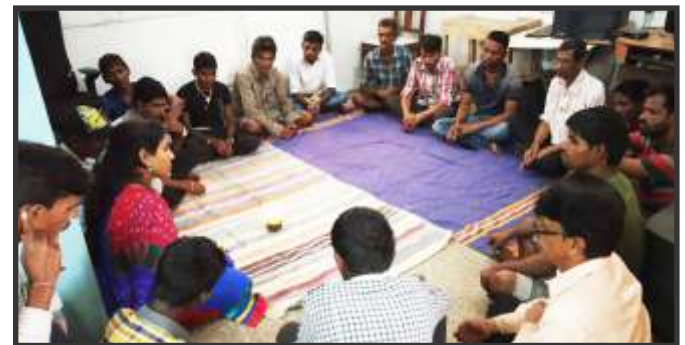
Group Counselling with Beneficiaries