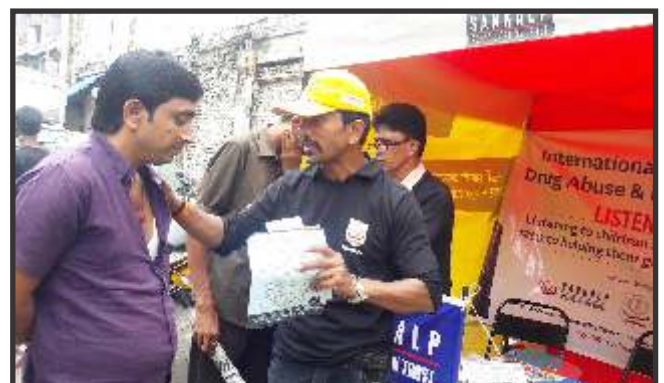
Sensitizing and Educating the Community near Grant Rd Station