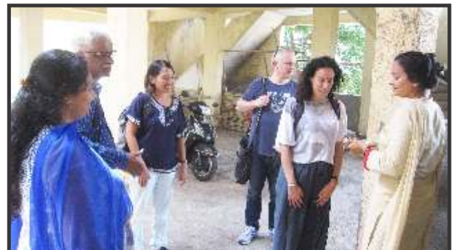
Inspirasia Foundation visits our Detox Centre in Vasai - 9th April 2018