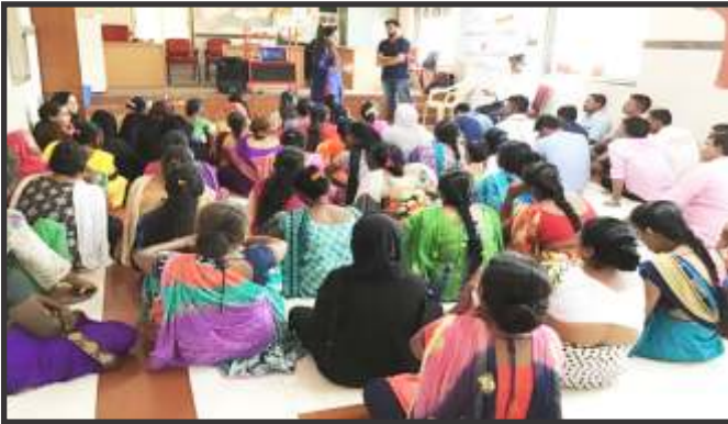
A Session with Parents of Students