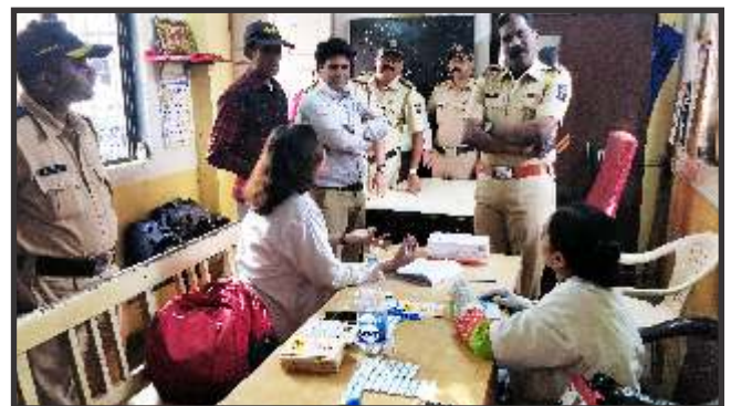
Awareness and Testing of Police Officers at Tardeo Police Station - 26th Dec 2018