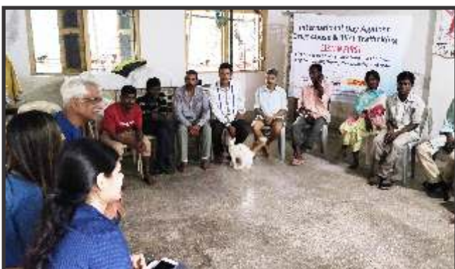
Student from TISS taking a session on disclosure and other related issues with positive clients