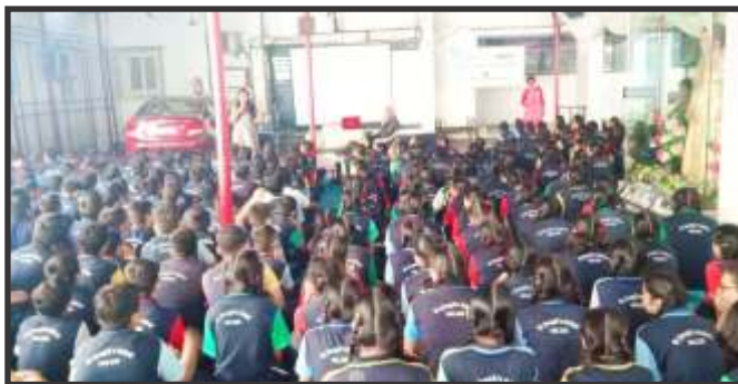
Awareness Programs among Students