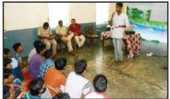
Interactive session with drug users at Arthur Road Jail.