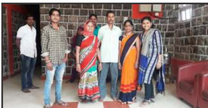
Family visits at the Good Shepherd Recovery Home, Rehabilitation Centre