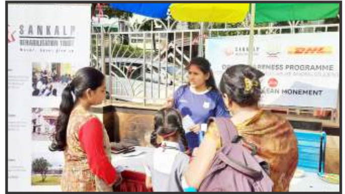
Generating Awareness within the General Public