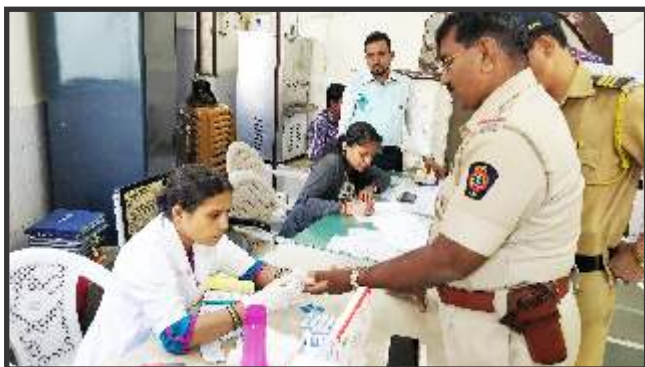
Awareness and Testing of Police Officers at Pydhone Police Station - 21st Dec 2018