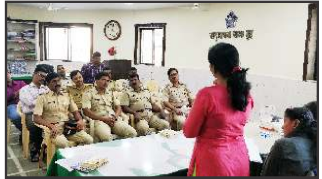
Sensitizing of Police Personnel at Pydhone Police Station with MDACS - 20th Dec 2018