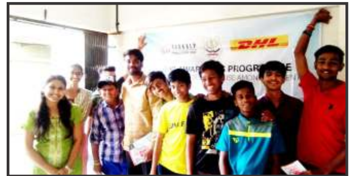
Prevention Programs with Adolescents