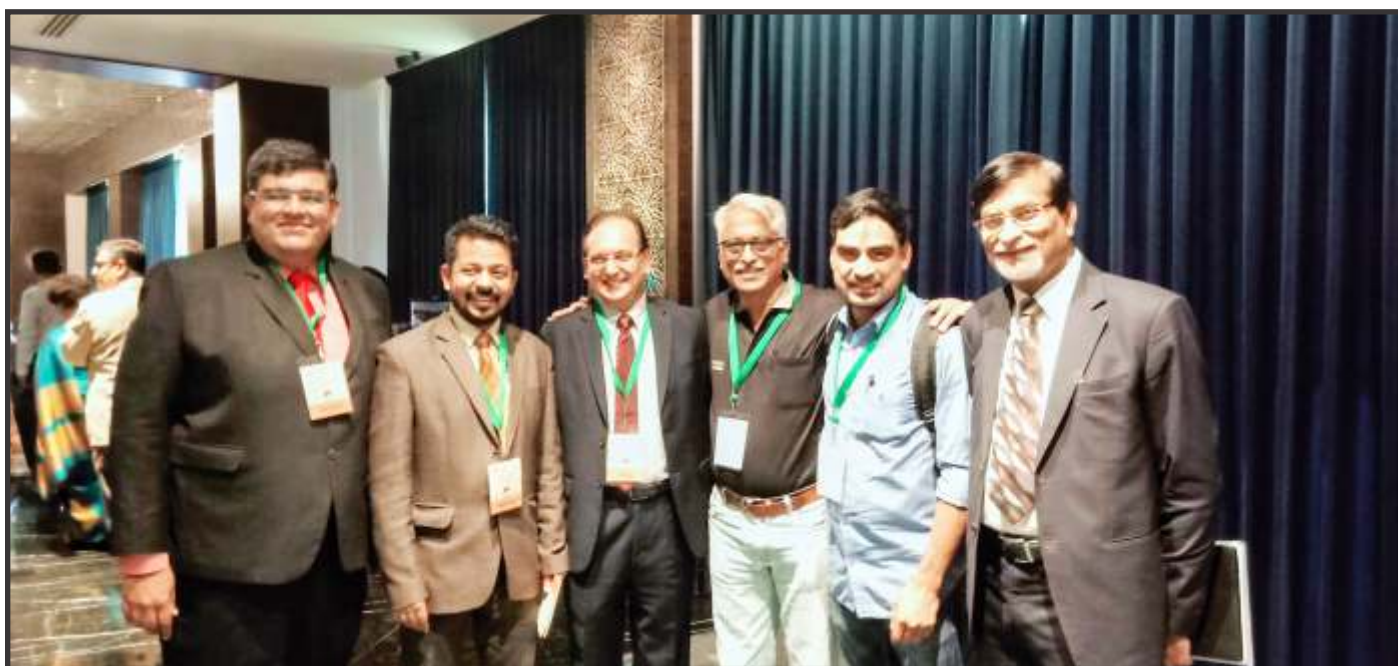
Attending a meeting on India's Response to Viral Hepatitis - 24th Feb

We will continue to strive for better treatment of our clients by actively extending our networking activities with a larger group of organizations.