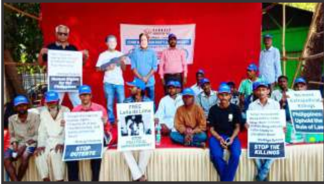
Protesting the deadly drug war in Philippines – 24th Feb 2019