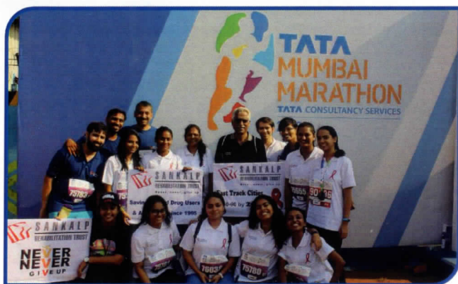
Raising awareness & funds through Tata Mumbai Marathon