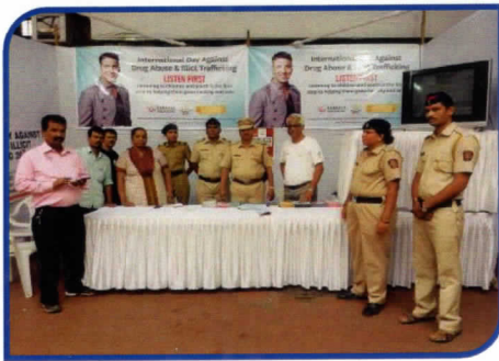
Interacting with the Railway Police at CST Station

In observation of International Day against Drug Abuse and Illicit Trafficking, Sankalp conducted various awareness campaigns throughout the city, including educational programmes at schools and colleges, informational stalls at key train stations, and interactive and motivational talks at government detox centers.