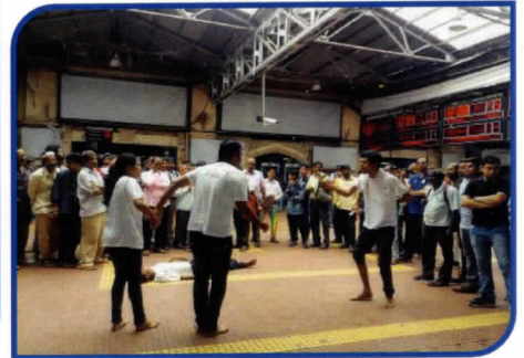
Street Play at CST Station, through Smita Patil Theatre