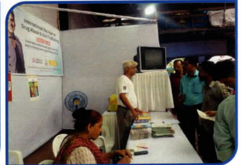
Interacting & distributing IEC material at a stall at CST station