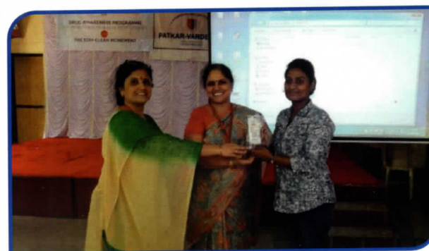
School Awareness Programs