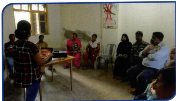
Group Family Counselling