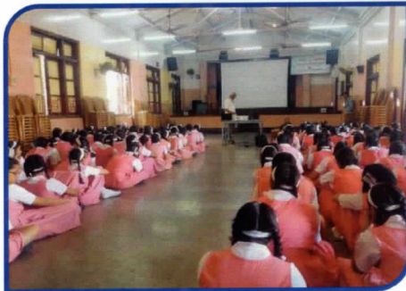
Awareness Program for students at St. Isabel High School, Mazgaon