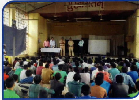
Program for inmates, especially those who use drugs at Thane Jail