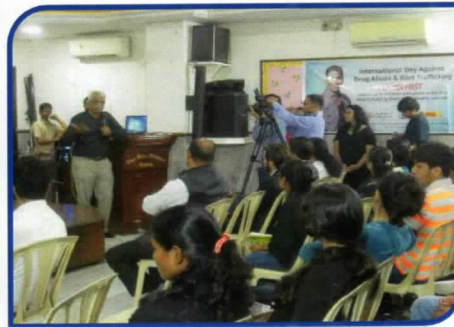
Educational session with students at Gopi Birla Memorial School