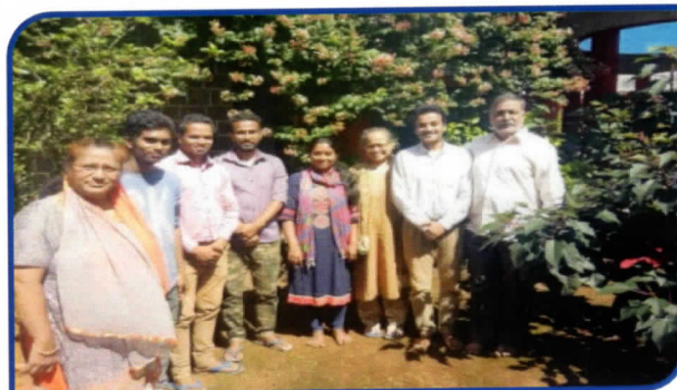
Family visit to GSRH