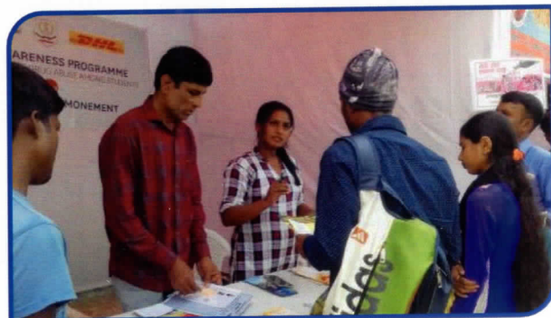
Community Awareness Programs