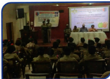
Session for NCC students at Maharshi Dayanand College