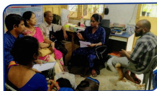
Individual Family Counselling