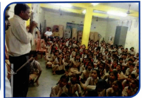
Awareness & Educational program for Students at RC School