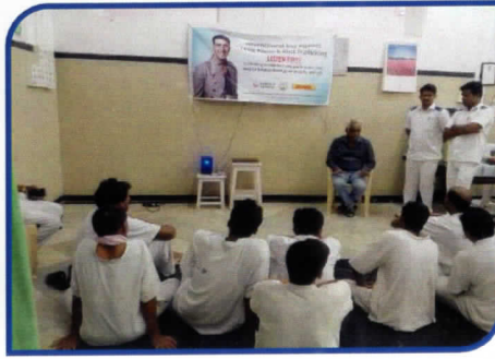
Program for staff & patients at G.T Hospitals Rehabilitation Ward.